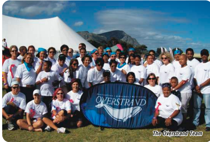
The Overstrand Team

This year the number of municipal teams that took part doubled from 9 to 18 teams, with each team consisting of 10-15 members. According to the Local Organising Committee (LOC) the estimated number of people involved in the